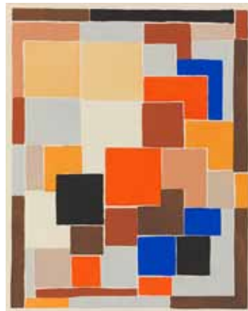
Sonia Delaunay. Plate 24 from the portfolio Compositions, Colors, Ideas. 1930. The Baltimore Museum of Art: Friends of Art Fund, BMA 1997.152.24.