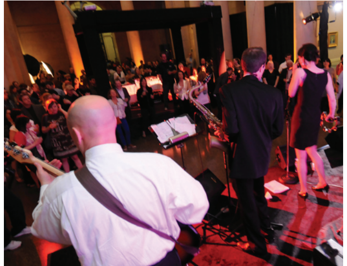
Over 1,400 visitors converged at the BMA for the previous late night.

Dynamic displays of artistic expression by b-grant prize winners will be peppered throughout the evening, spanning from performance art to storytelling. Access to the exhibition during extended evening hours, cash bar, and light fare cap off an evening you won't forget.