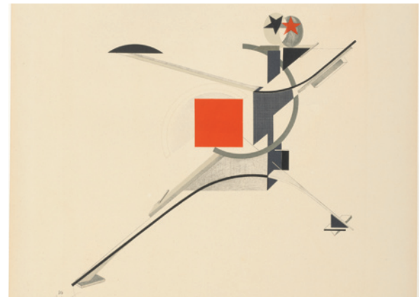
El Lissitzky. Top: Old Man, His Head Two Paces Behind, Plate 8 and Bottom: The New One, Plate 10 from the portfolio Figurines: The Three-Dimensional Design of the Electro-Mechanical Show 'Victory over the Sun'. 1920-1921, published 1923. The Baltimore Museum of Art, BMA 1956.39.8 and 1956.39.10.