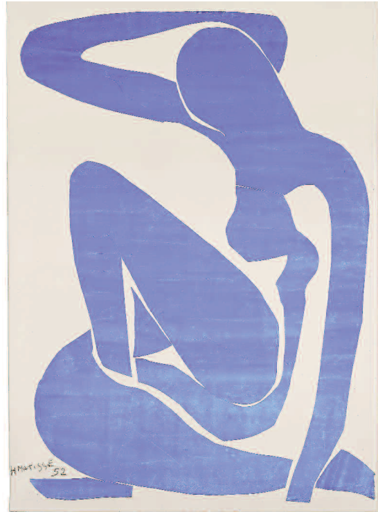
Henri Matisse. Blue Nude I. 1952. Fondation Beyeler, Riehen/Basel