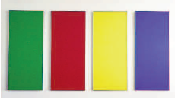
Ellsworth Kelly. Green Red Yellow Blue . 1966. Private Collection, Baltimore: Promised Gift to The Baltimore Museum of Art.